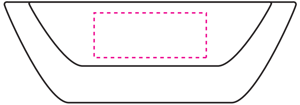
Binnenzijde: 50 x 20 mm