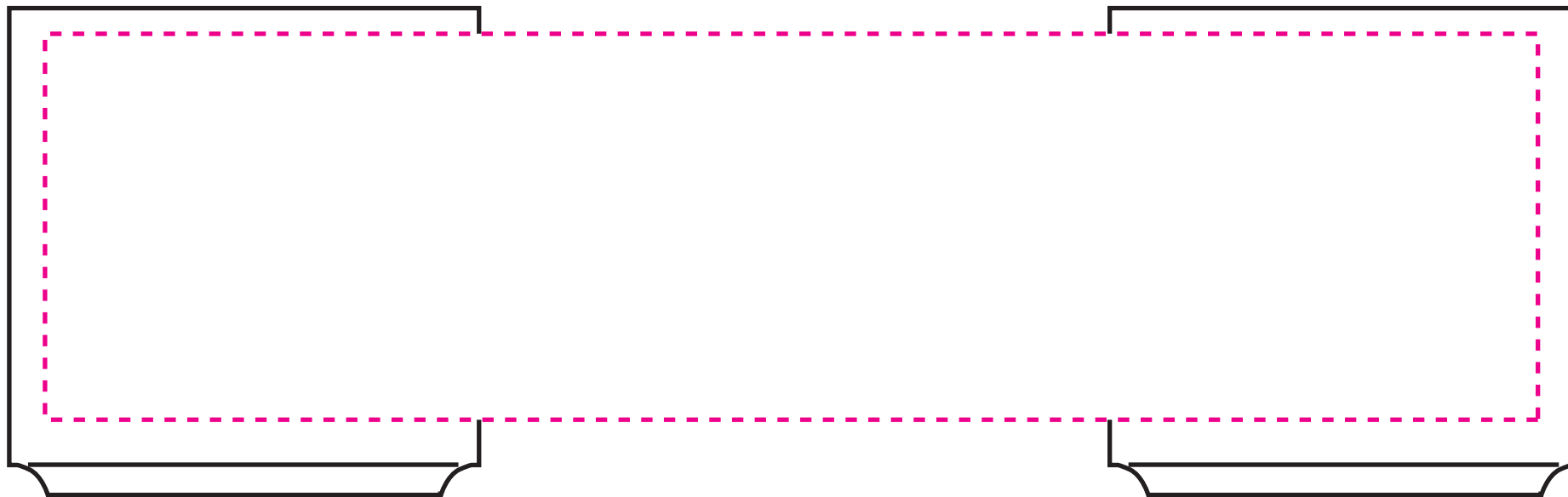
Rondom: 232 x 60 mm